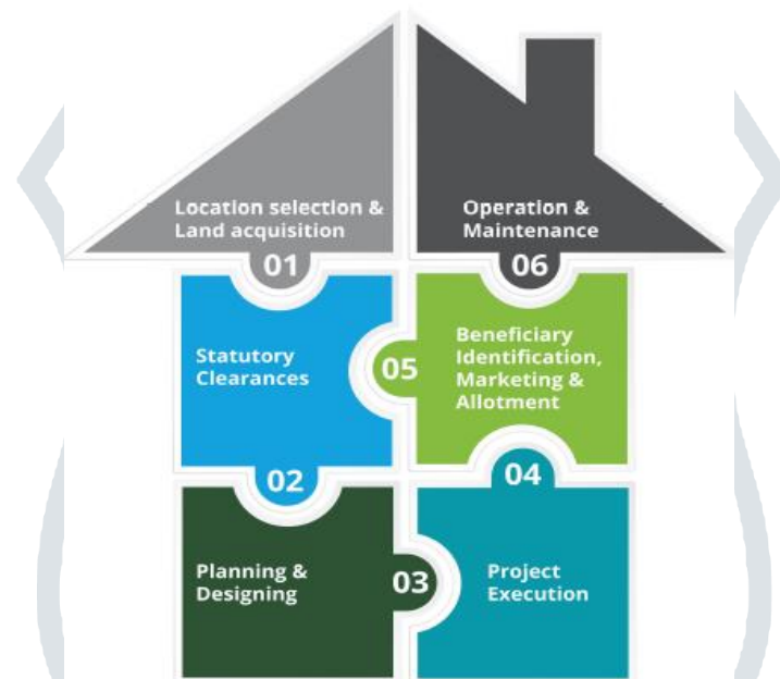
Fig. 1: Affordable Housing Ecosystem