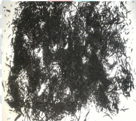
Fig. 2: Tyre Waste used for stud

Tyre waste which was used in the study is shown in fig 2 and detailing if its size is shown in table1 below: