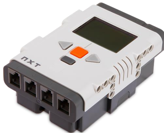
Fig 3: NXT intelligence brick [2]