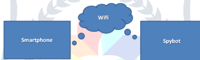
Fig 1: Communication using wifi

Mostly robots are controlled based on remote control but the problem is range if controlling for increasing range of controlling it better to use a Wi-Fi module which can access by a smart phone.