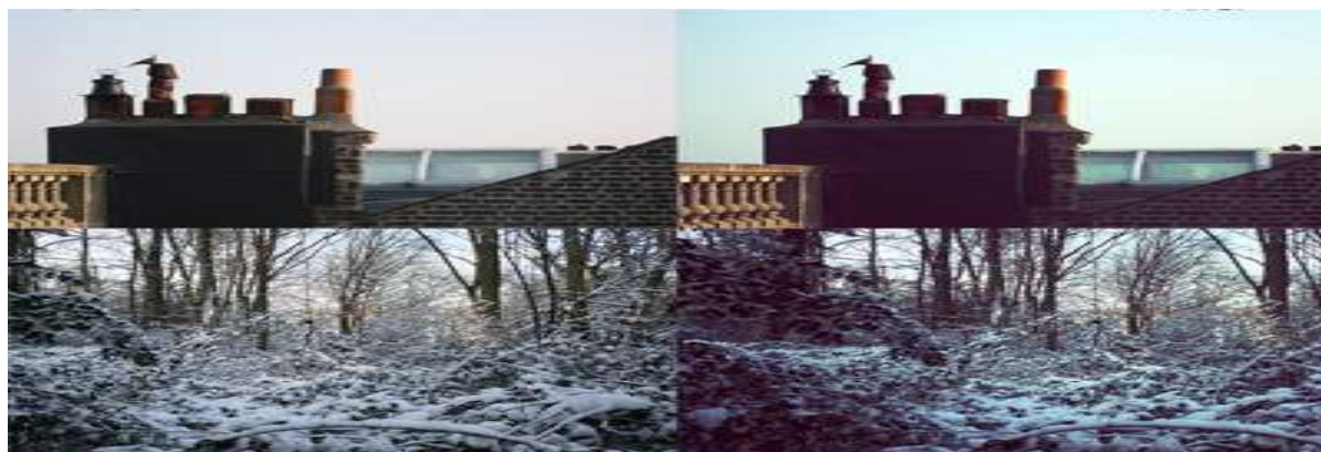
Figure 1. Showing the effect of Image Enhancement

This paper provides an overview of underlying concepts along with the algorithms commonly used for image enhancement and focuses on spatial domain techniques for image enhancement, with particular reference to point processing methods.