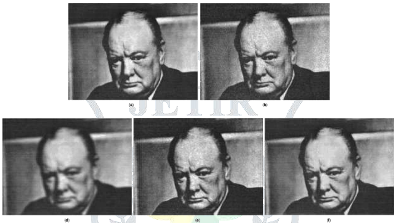
Figure 2. (a) Original “Winston” image. (b) Corrupted “Winston” image with additive Gaussian-distributed noise ( \sigma = 10 ). (c) Average filter result ( 5 \times 5 window). (d) Gaussian filter result (standard deviation \sigma = 2 ). (e) Ideal low-pass filter result (cutoff = N/4 ). (f) Wavelet shrinkage result.

If \mathbf{G} is corrupted as in Eq. (4) and \mathbf{N} contains white noise with zero mean, then enhancement means noise-smoothing, which is usually accomplished by applying a low-pass filter of a fairly wide bandwidth. Typical low-pass filters include the average filter, the Gaussian filter and the ideal low-pass filter. The average filter can be supplied by averaging a neighborhood (an m \times m neighborhood, for example) of pixels around G(i, j) to compute J(i, j) . Likewise, average filtering can be viewed as convolving \mathbf{G} with a box-shaped kernel \mathbf{F} in Eq. (7). An example of average filtering is shown in Fig. 2(a)-(c). Similarly, a Gaussian-shaped kernel \mathbf{F} may be convolved with \mathbf{G} to form a smoothed, less noisy image, as in Fig. 2(d). The Gaussian-shaped kernel has the advantage of giving more weight to closer neighbors and is well-localized in the frequency domain, since the Fourier transform of the Gaussian is also Gaussian-shaped. This is important because it reduces noise leakage at higher frequencies. In order to provide an ideal cutoff in the frequency domain, the FFT of \mathbf{G}_0 can be zeroed beyond a cutoff frequency (this is equivalent to multiplying by a binary DFT \mathbf{F}_0 in Eq. (7)). This result, shown in Fig. 2(e), reveals the ringing artifacts associated with an ideal low-pass filter.