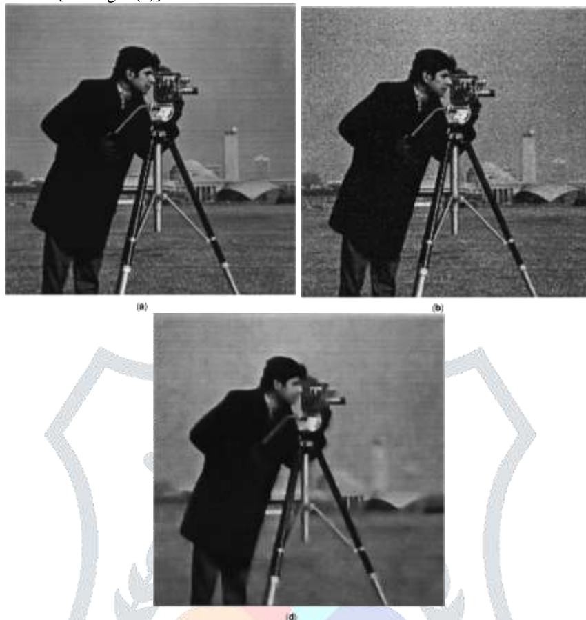
Figure 4. (a) Original “Cameraman” image. (b) “Cameraman” image corrupted with additive Laplacian-distributed noise. (c) After eight iterations of anisotropic diffusion with diffusion coefficient in Eq. (21). (d) After eight iterations of anisotropic diffusion with diffusion coefficient in Eq. (22).

are preserved, but several outliers remain [see Fig. 4(c)]. Using the diffusion coefficient of Eq. (22), the noise is eradicated but several fine features are blurred [see Fig. 4(d)].