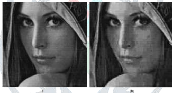
Figure 5. (a) Original “Lena” image. (b) “Lena” JPEG-compressed at 32:1. (c) Wavelet shrinkage applied to Fig. 5b. (J. Webster (ed.), Wiley Encyclopedia of Electrical and Electronics Engineering Online Published by John Wiley & Sons, Inc.)

Figure 5 illustrates an example of the enhancement of JPEG-compressed images (20). Figure 5(a) shows a part of the original image. Fig. 5(b) shows the same part in the JPEG-compressed image with a compression ratio 32:1, where blocking artifacts are quite severe due to the loss of information in the process of compression. Figure 5(c) reveals the corresponding part in the enhanced version of Fig. 5(b), to which we have applied wavelet shrinkage. One can find that the blocking artifacts are greatly suppressed and the image quality is dramatically improved.