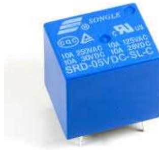
Figure 3 :Relay

It receives the input signal from the interface card and transmits to the solenoid valve. It provides the 120v AC supply and 24v DC supply. The range of the signal is depends on transmitter that what is the range of the transmitter. Different frequency is on both ends of the transmitter, distance is also depends on this.