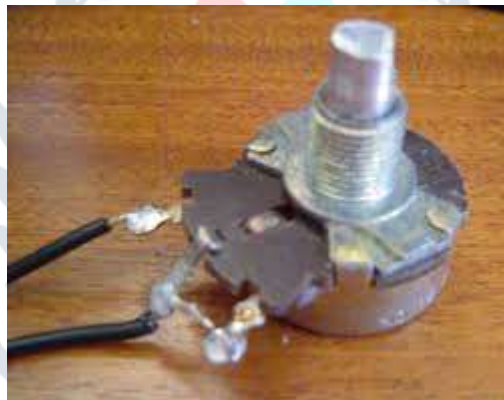
Figure 4: DigiPot

A digital potentiometer (also called a resistive digital-to-analog converter, or informally a digipot) is a digitally-controlled electronic component that mimics the analog functions of a potentiometer. It is often used for trimming and scaling analog signals by microcontrollers.