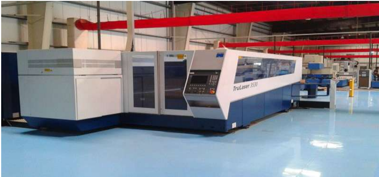
4000 watts co2 laser cutter