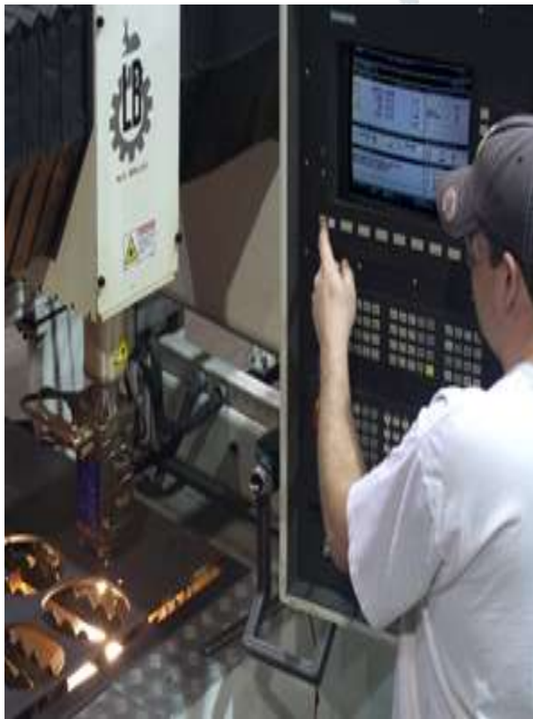
Industrial laser cutting of steel with cutting instructions