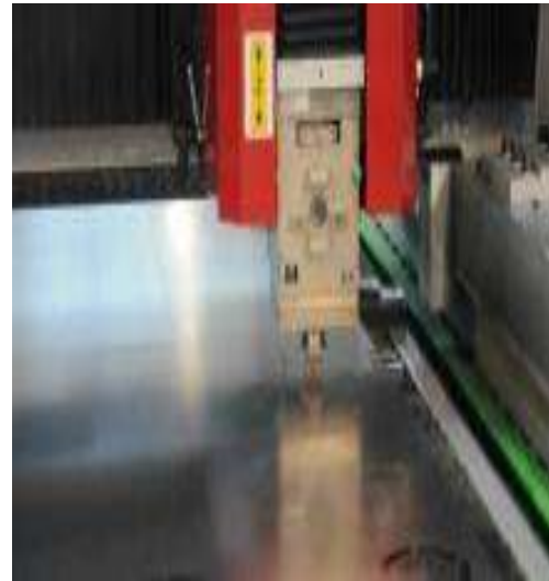
Laser cutting process on a sheet of steel