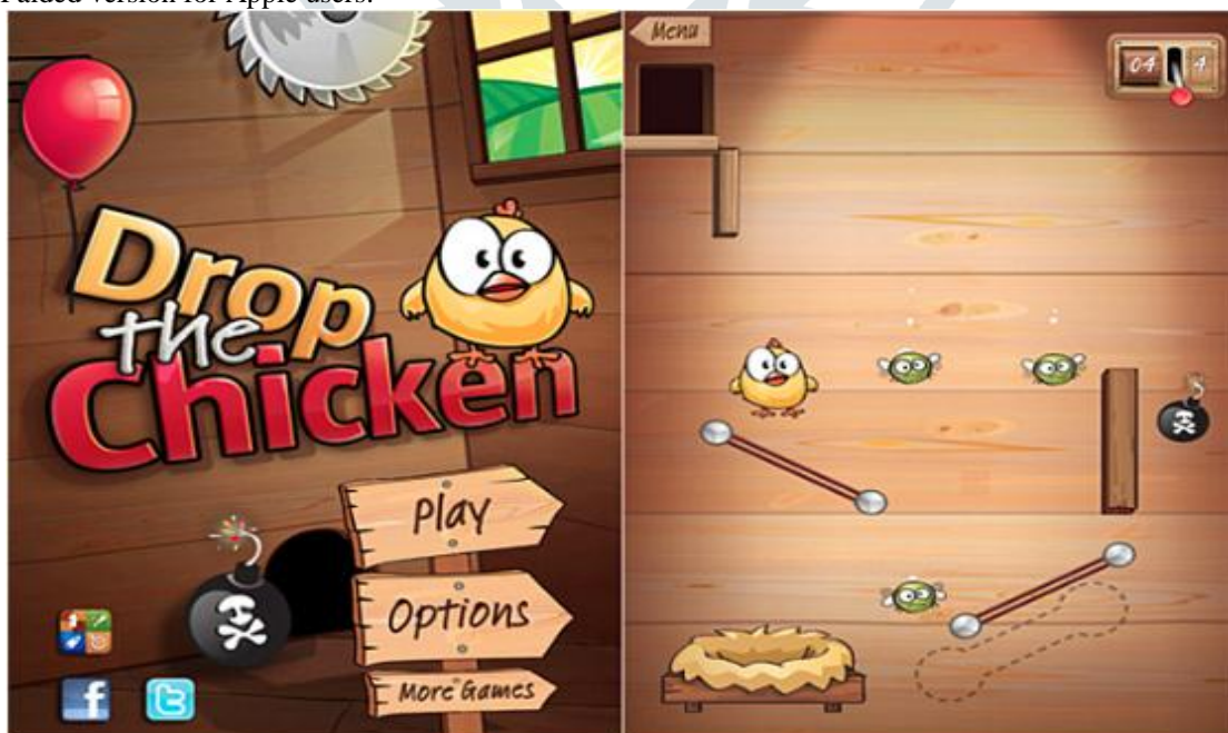
Figure 3 Drop The Chicken Game Scenario [4]

The Chicken Drop game is available in an Android-Samsung Smart Phones and Drop the Chicken game is available in iOS App Store-iTunes-Apple. Drop The Chicken is a fully animated addictive, super cool and challenging puzzle game for players. It is Paid version for Apple users.