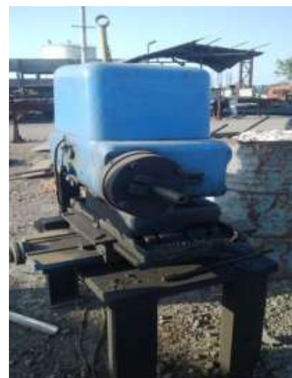
Figure 5: Machine setup