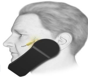
Figure 2: The ATI Neurostimulation System

Autonomic Technologies, Inc. (ATI) has developed the ATITM Neurostimulation System to deliver low-level electrical stimulation to provide therapy to relieve the pain of cluster headache. The ATI Neurostimulator is embedded through a little cut in the upper gum;ans is situated at the SPG nerve pack. It is find right by the client's agony. This method leaves no scars. After the gadget is set up, and once the agony kicks in, the remote controller is set by the patients on his/her cheek. This will transmit signs to the addition gadget, and will permit the torment to stop.