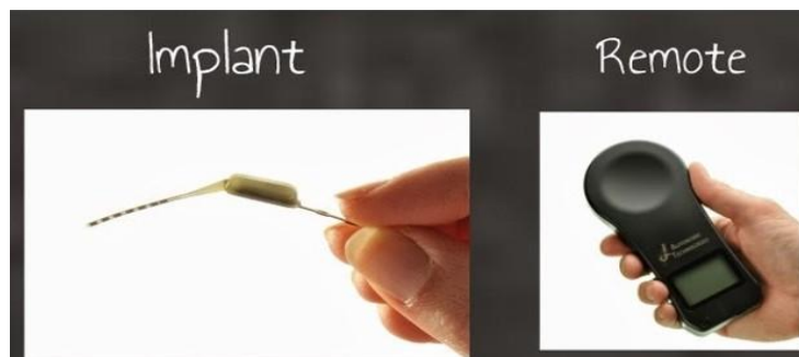
Figure 3: The ATITM Neurostimulation System: Tools

The ATI Neurostimulation System consists of two separate devices, the neurostimulator and the handheld remote controller, and requires invasive surgery. The neurostimulator, shown below, is roughly the size of an almond. It has two ends, with one a slender probe. The probe is essentially attached to the SPG (Sphenopalatine Ganglion) bundle of nerve fibers and the device implanted in the upper mandible (within the gum, usually just below the eye socket) on the side of the head where the patient suffers most from pain. The patient is then given a small hand-held controller where, upon first experiencing the beginning signs of a headache can place the remote directly to their head to stimulate the device. This stimulation will send electrical impulses through the device to the SPG bundle, and ultimately prevent the nerves from releasing the neurotransmitters causing the pain (PSC). Patients also have the option of having the device removed once condition improves.