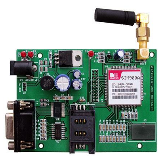
Fig. 3 GSM Module

We can send SMS and also send a voice message. These SMS or voice messages are saved in the microcontroller memory. Multiple SMSs can also be sent to user, police and fire station etc. This module is designed in a way so that user can connect this module without Serial cable, this module can be connected to any of Serial to USB converter module or cable.