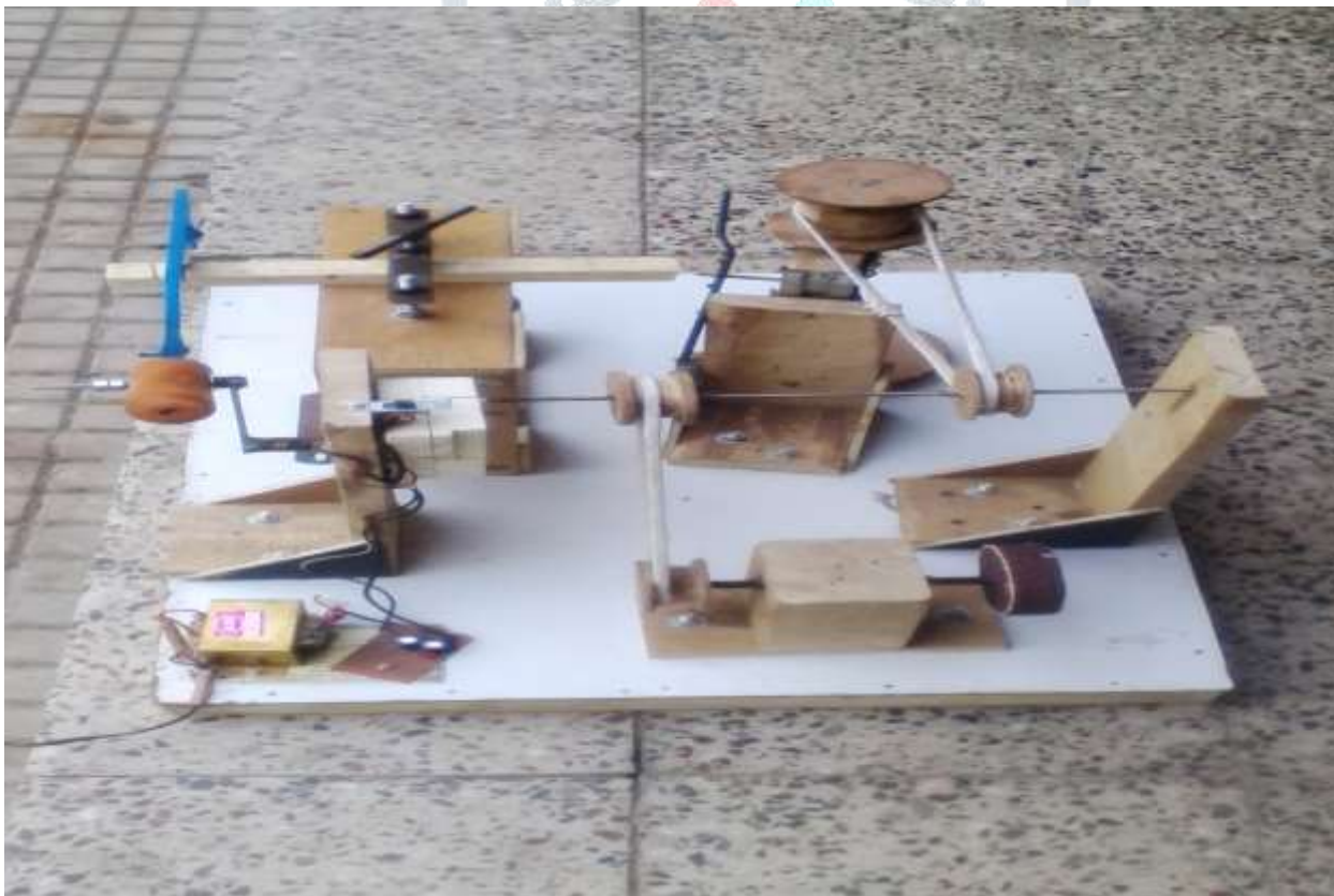
Fig. 2. Set up of the machine