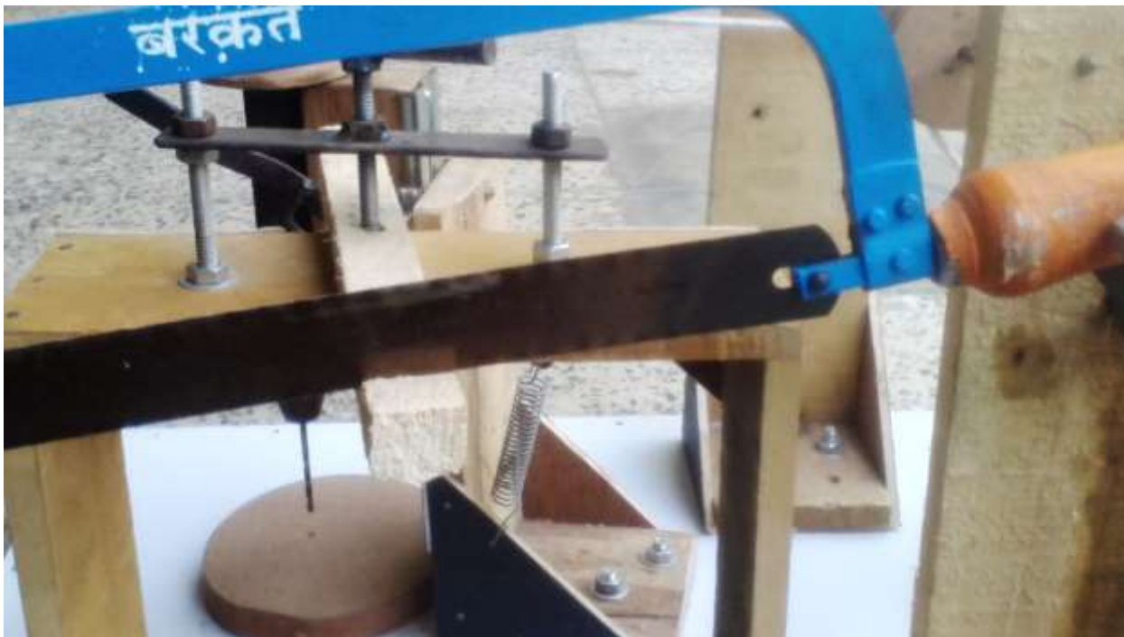
Fig. 3. Cutting operation by the machine