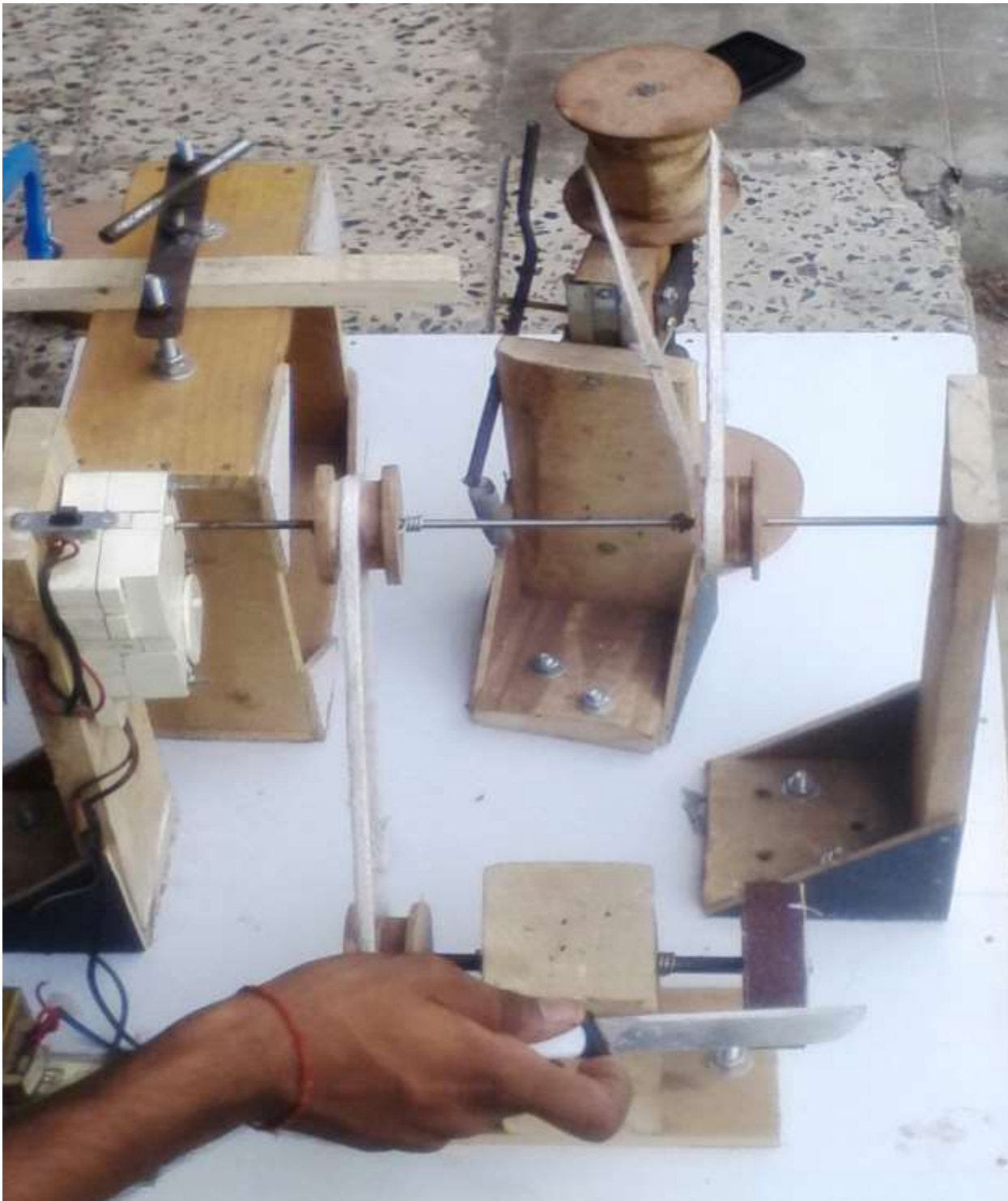
Fig. 5. Grinding operation by the machine