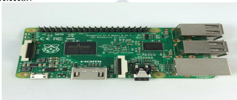
Fig. 6. Raspberry Pi2