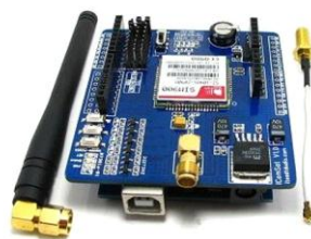
Fig. 1. GSM.

The GSM which is one of the representative wireless networks which has low-power, low-cost and convenience to use .Global System for Mobile Communications originally from Group Special Mobile is the most popular standard for mobile telephony systems in the world. The GSM Association, its promoting industry trade organization of mobile phone carriers and manufacturers, estimates that 80% of the global mobile market uses the standard. GSM is used by over 1.5 billion people across more than 212 countries and territories. A GSM modem is a specialized type of modem which accepts a SIM card, and operates over a subscription to a mobile operator, just like a mobile phone. From the mobile operator perspective, a GSM modem looks just like a mobile phone. When a GSM modem is connected to a computer, this allows the computer to use the GSM modem to communicate over the mobile network.