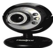
Fig.3. Web Camera