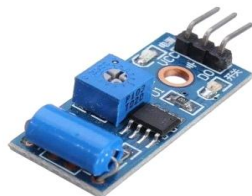
Fig. 2. Vibration Sensor.

In the system we will be using a vibrating sensor (piezoelectric transducer) to find vibration from ATM machine whenever robbery occurs.