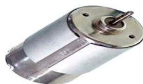
Fig.4. DC motor.

For the Closing the ATM door, we are using DC motors. It is operated by 12VDC power supply. In any electric motor, operation is based on simple electromagnetism. A current carrying conductor generates a magnetic field; when and to the strength of the external magnetic field