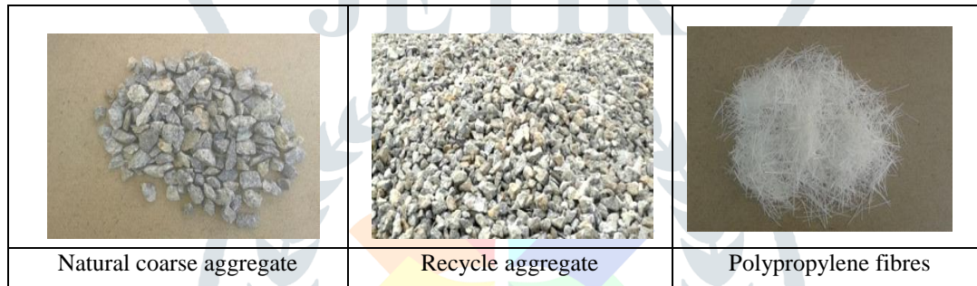
Figure 1: Materials