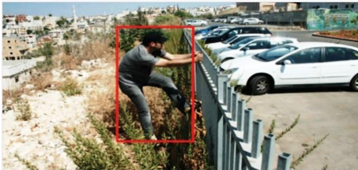
FIGURE 1: PERIMETER PROTECTION FOR SECURITY AND SURVEILLANCE.

Video Analytics and Video Management System (VMS), and it is becoming extremely essential for Building Security, Perimeter Protection, Safety, Asset Protection and Business prospects etc.