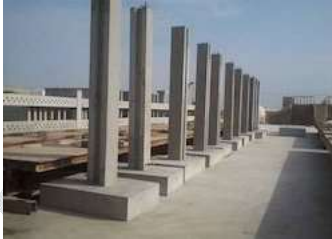
Fig-3 Superior Quality Concrete Columns

Most of the companies maintain international standards for example, BIS ( Bureau of Indian Standards ) is the regulatory body in India to specify and enforce the quality to be maintained in any type of construction. But proper use of a material through a good construction practice is very important. Good quality cement doesn't mean it will form good concrete. For getting good quality concrete you will need good stone, good sand, good workmanship, proper water cement ratio and expert supervision.