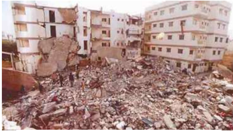
Fig-1 Taluka of Kutch District of Gujarat, India

Its epicenter was about 9 km south-southwest of the village of Chobari in Bhachau. The disaster was not the result of earthquake only. A building or bridge, at first and foremost, must be capable of carrying the gravity load and then also the load of other things that we put on it i.e. the loads coming from its usage type. Next, the designer emphasizes on its resistance against natural calamities like earthquake and severe storm that a structure 'may' experience during its life cycle. Importantly expert supervision and use of materials of better quality may offer additional safety margins against earthquake or other unforeseen natural calamities. Magnitudes of loads coming on the structure from such calamities are often quite unpredictable. Many of the existing old buildings in India especially in Northern region like Delhi are not fit to face a big earthquake, if it really hits. It will cost a lot on life and property.