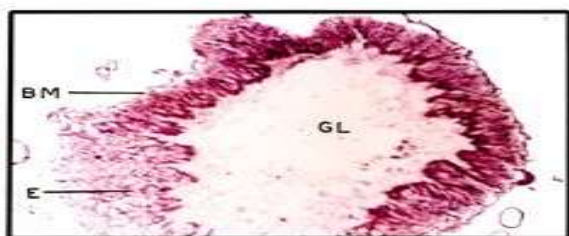
Fig : 1

Thus it is concluded that both these biopesticides have enough potentiality to suppress the dangerous pest Helicoverpa armigera , a better scope for agriculture and environment.