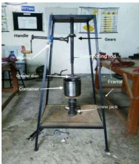
Fig: 3.1 Actual photo of Grinding and blending unit

The function of the blender is to mix the agro waste stuff homogeneously with the binder to make the dense stuff .After the agro stuff is grinded properly then shifted to the blender drum in blender the blender arm is dipped fully inside the stuff and rotated by means of the gears provided to the arm the agro stuff get rotated to the edges of the blender arm and get mixed with the binder and forms the bonded structure of some density. The mixture us blended enough to make the stuff viscous so that it can take shape from the outlet of the extruder.