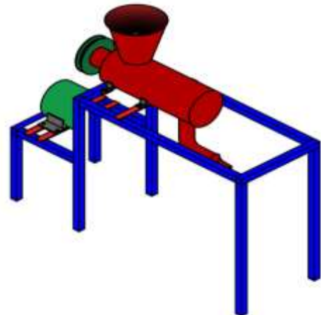
Fig: 3.2 Cad Model of Briquetting machine

The cylindrical shaped briquettes are wet due to binder so their moisture is soaked by treating them with the smokes created from the fire which can evaporate the moisture from the briquettes so that they can become dry and can be used for fire purpose.