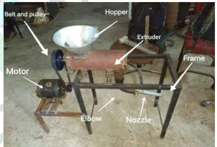
Fig: 3.3 Actual photo of Briquetting machine