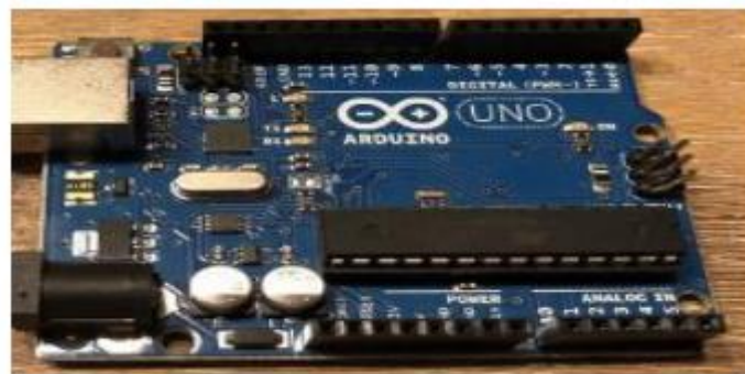
The Arduino Uno Board which we are going to install in bus and traffic signal