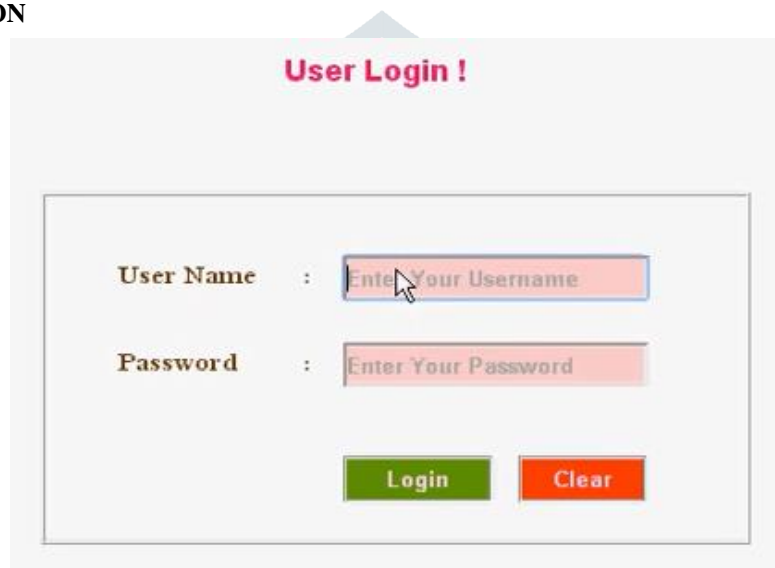
Figure 2 User Login