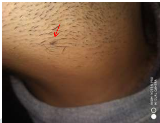
Fig. 1.2 Red arrow showing a large wart on neck region.