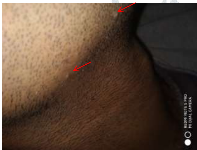
Fig. 1.3 Red arrows showing warts on chin region.