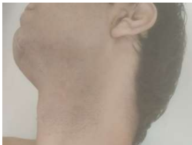
Fig. 2.1 Shows treated chin and neck region without any recurrent wart or rudimentary scar or spot three months post treatment.