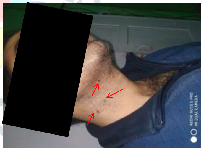
Fig. 1.8 Red arrows showing scars of wounds on chin and neck.