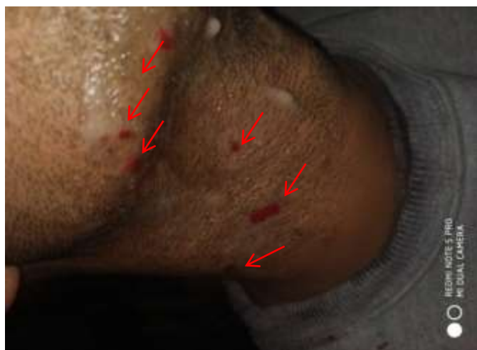
Fig. 1.5 Red arrows showing wounds of cut warts treated with mixture of baking soda and castor oil on chin and neck region.