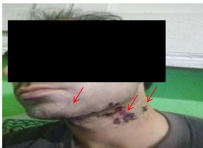
Fig. 1.6 Red arrows showing healing of wounds of cut warts treated with mixture of baking soda and castor oil on chin and neck region.