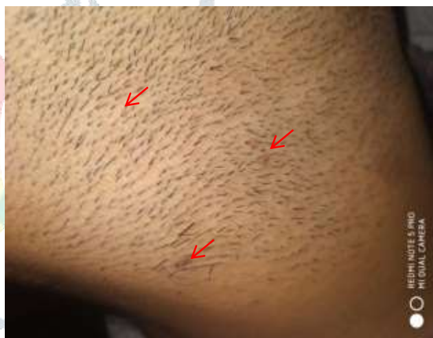
Fig. 1.4 Red arrows showing warts on neck region.