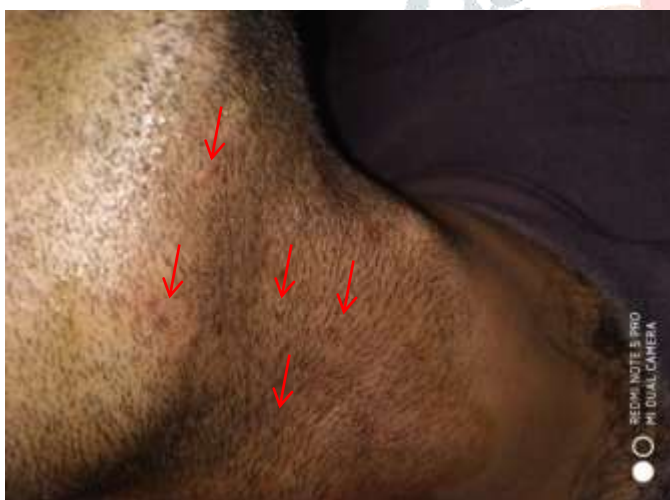
Fig. 1.7 Red arrows showing recovery of wounds treated with mixture of baking soda and castor oil on chin and neck region.