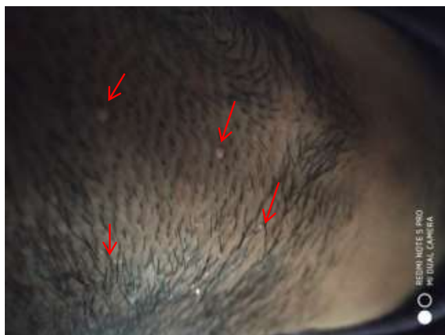
Fig. 1.1 Red arrows showing warts on neck region.