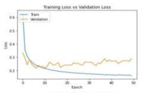
Figure 3.Loss Graph