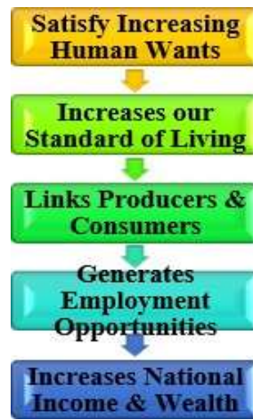
Fig 2: Importance of Commerce Education(Source: