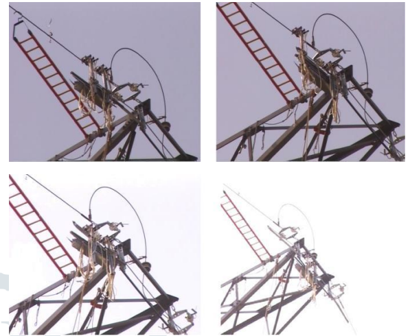
Fig. 4 The experiments of the inspection robot

The inspection robot was trained with the expert system for many times in the laboratory where the torsion tower and anchor tower were placed to imitate the real environment. Finally, the inspection robot was tested in the real tower. The new method of negotiating obstacles is proposed with the bridge installed in the torsion tower. Fig. 10 shows that the robot is crossing through the 500KV torsion tower in the overhead ground wires. The ladder remained in the tower after the robot was lifted to the overhead ground wires from the ground. When the experiment was finished, the ladder was taken away from the power tower. A bridge is installed on the torsion tower. The robot walked along the left overhead ground wires on the torsion tower in Fig. 10(a). The robot must walk along the bridge if it wanted to cross the torsion tower. The robot must hold the overhead ground wires with the left claw, move the control box to the left to keep its balance, and stretch the right arm to catch the bridge in Fig.10 (b).