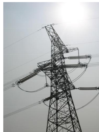
Fig. 1. A 500KV tower

A 500KV torsion tower is shown in Fig. 1. The detail appearance of the overhead ground wires is described in Fig. 1(b). The inspection robot with wheel-driven can crawl along the overhead ground wires. The subsidiary equipment's of the overhead ground wires will act as obstacles to block its way. A navigation system is needed to recognize and locate the obstacles with its sensors. The control system of inspection robot will plan its motions according to the obstacle information to negotiate these obstacles autonomously. There are three typical obstacles attached to the overhead ground wires and 550KV power tower. The first type of obstacle is called counterweight which is the greatest quantity among the obstacle. The second type of obstacle is anchor tower which is easy for the inspection rotor to cross. The third type of obstacle is called torsion tower which is difficult for the inspection rotor to cross. Each type of obstacle has different spatial structure. Therefore, the inspection robot should walk with the different motion sequence according to the different obstacle.