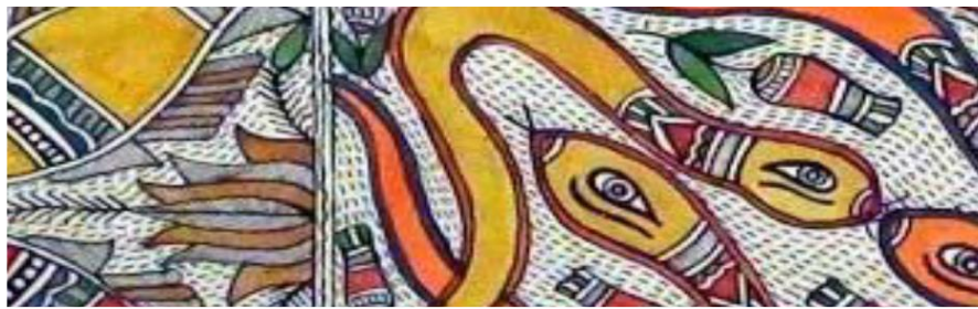
Figure 3: A Contemporary Mithila paintings depicting symbolic themes

Till date the artisan of Madhubani paintings are used colours directly from nature. Lamp soot served as a source of black, White from powdered rice, green was made from the leaves of the apple tree and Tilcoat, blue from the seeds of Sikkot and indigo, yellow was drawn from the parts of singar flower or Jasmine flower, bark of peepal was to be boiled to make a part of saffron colour, red was made from kusum flower and red sandal wood. To make the painting last long as well as take vividness they mixed gum with colour. Artist Shanti Devi says that the use of synthetic colour and modern round brushes are programs the cotton tipped bamboo sticks and stiff twigs that used to serve as brushes still a few years back. A living artist Gouri Shankar interpreted that, at first he made rough sketch then detail drawing of subject matter is finished with bold strait and curve lines. At last the drawing is filled with various colours whenever it is necessary. The colours in the paintings are applied flat and the figures are rendered with double outlines with the space in between filled with thin crosshatchings or slanting lines. Over a period of time distinct style evolved with practitioners from deferent social background bringing their own word view and aesthetics understanding into their paintings. These styles can broadly be categorized as geru, bharhi, kachni, gobar and godna.