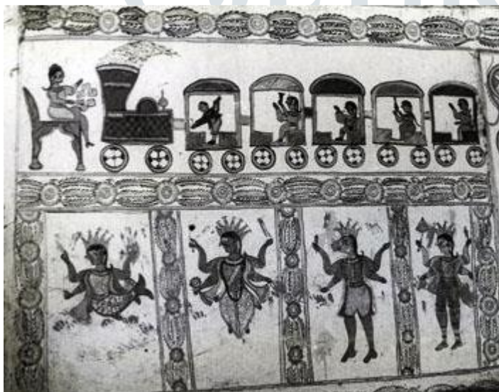
Figure 2: A traditional Mithila painting on wall depicting religious theme (God and goddess)

3) Paintings on movable objects: It includes those on clay models of pots, elephants, birds, bamboo structure, mats, fan and objects made of sikkhi (thin wood). Decorative multicoloured designs made on the faces of the brides and sumangalis also fall in this category. Many of these paintings have great tantric significance.