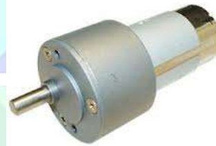
Fig4: DC dynamo

A motor-generator (an M-G set or a dynamotor for dynamo-motor) is a device for converting electrical power to another form. Motor-generator sets are used to convert frequency, voltage, or phase of power. They may also be used to isolate electrical loads from the electrical power supply line. Large motor-generators were widely used to convert industrial amounts of power while smaller motor-generators (such as the one shown in the picture) were used to convert battery power to higher DC voltages.