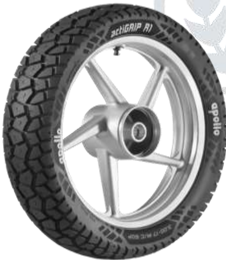
Fig3: Fly wheel

A flywheel is a rotating mechanical device that is used to store rotational energy. Flywheels have a significant moment of inertia and thus resist changes in rotational speed. The amount of energy stored in a flywheel is proportional to the square of its rotational speed. Energy is transferred to a flywheel by applying torque to it,