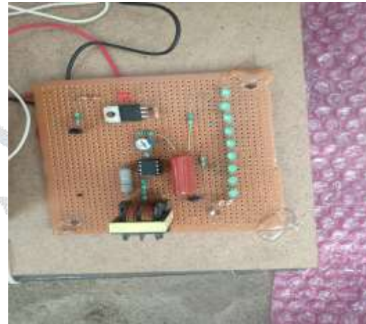
Fig 7 :Boost converter circuit