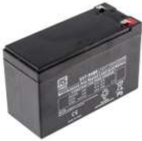
Fig2: Rechargeable Battery

A rechargeable battery, storage battery, or accumulator is a type of electrical battery. It comprises one or more electrochemical cells, and is a type of energy accumulator. Rechargeable batteries come in many different shapes and sizes, ranging from button cells to megawatt systems connected to stabilize an electrical distribution network. Rechargeable batteries are known as secondary cell because its electrochemical reactions are reversible.