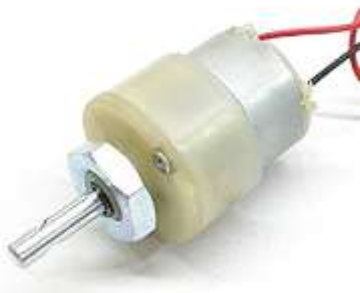
Fig6: DC motor

A DC motor uses electrical energy to produce mechanical energy, very typically through the interaction of magnetic fields and current-carrying conductors.