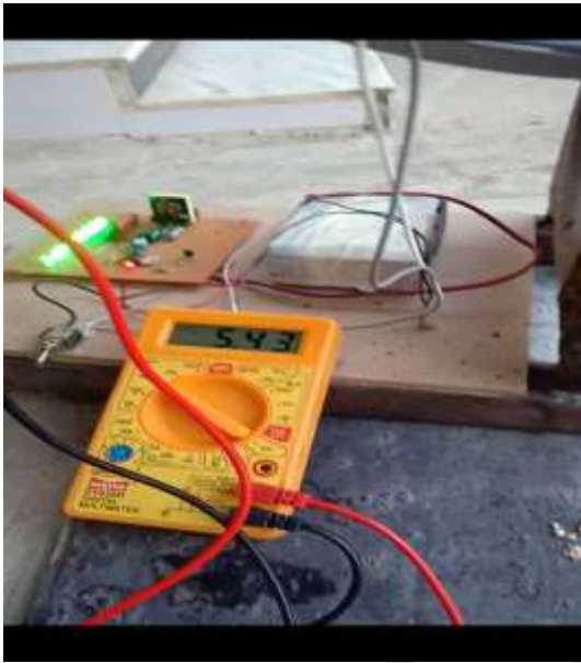
Fig 10: To know the voltage of battery using multi meter

when the battery is turned off the voltage will get reduced slowly from 11.7v to 0v and this output is used as regeneration of current in the batteries.