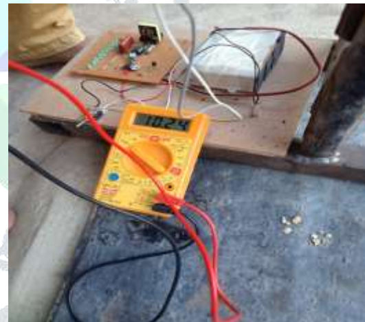
Fig 8: out put voltage of Regenerative Braking System up to 11.7v