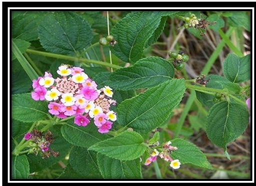
Plate 1: Lantana Camara leaves