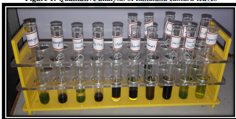
Figure 1: Qualitative analysis of Lantana camara leaves

The qualitative phytochemical screening of methanolic extract of Lantana camara leaves showed the presence of various bioactive secondary metabolites constituents in alkaloids, flavonoids, phenols, tannins, saponins, carbohydrates, amino acids, steroids, terpenoids and protein were respectively (Fig 1 and Table 1).