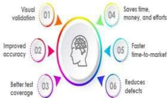
Fig i: The benefits of integrating Artificial Intelligence in Software Testing