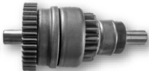
Fig 1.4 Pinion Gear without chamfer