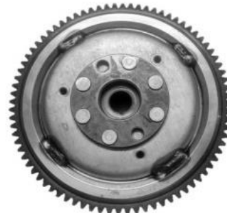
Fig 1.3 Before modifying Flywheel ring gear