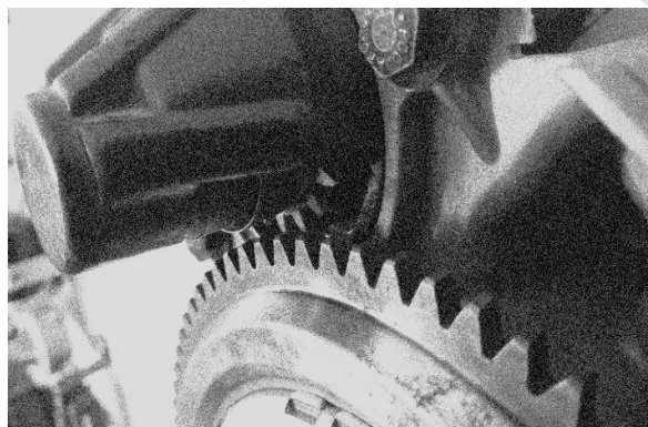
Fig:1.1 Flywheel ring gear and pinion

ATUL AUTO LIMITED, foremost automobile industrial manufacturing industry in India. Vehicles manufactured & proposed different categories of model Gem, Gemin, Smart in addition Shakti model automobiles in multi-fuel range i.e. Petrol, CNG, LPG & Electronic in both traveler and goods transport vehicles. Atul Auto Limited, launched new model name Atul Gem Premium Traveler Vehicle consecutively in gasoline fuel. After some challenging on road testing, the problem of starting noise in vehicle and starting failure is re-counted. Factually number of vehicles are on thoroughfare testing and number of difficulties reports also enlarged [1].