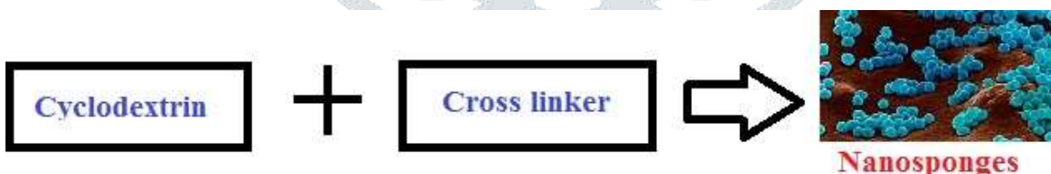
FIGURE2. Formation of Nanosponges

In this technique cyclodextrin is reacted with cross linker like di-isocyanates, diaryl carbonates, carbonyl diimidazoles etc. the dimensions of the sponges is controlled in line with body, surface charge density for the attachment to totally different molecules. Depending upon the cross linker nanosponges are synthesized in neutral or acidic type. Capability of nanosponges to encapsulate drug having totally different structures and solubility. They are accustomed improvement of binary compound solubility of poorly- water soluble medicine primarily BCS categoryII medicine[25-27].