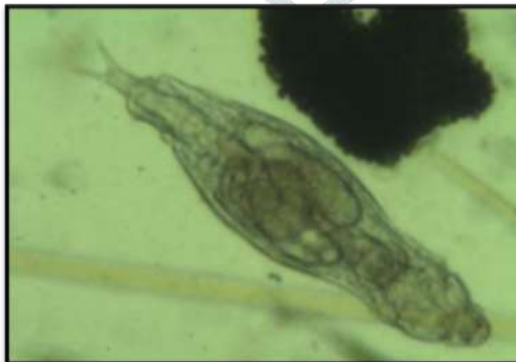
Figure:-1. Dactylogyru sp. with distinct marginal hooks (arrow) (Wetmount,100x)

Diagnostic histopathological lesions identified: Detection of the parasites in the squas preparation of the gill of the affected fishes helped in the diagnosis of the disease. The main histopathological lesion were seen in the gills where the parasites were found attached to the secondary lamellar epithelium and fusion of adjacent gill lamellae were the tissue level reactions caused by the parasites.