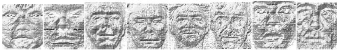
Fig 2: Output of LBP Operator

In the method described above, the LBP operator, produce eigenface of each input Image in training set, as shown in Fig 2, and one the “most nearest” image is found from them. The “nearest” image is calculated using the Euclidean distance formula in equation. The final output of the classification method is the accuracy rate. Accuracy rate compute by dividing the number of all correct predicted items in test set with the number of items in test set.