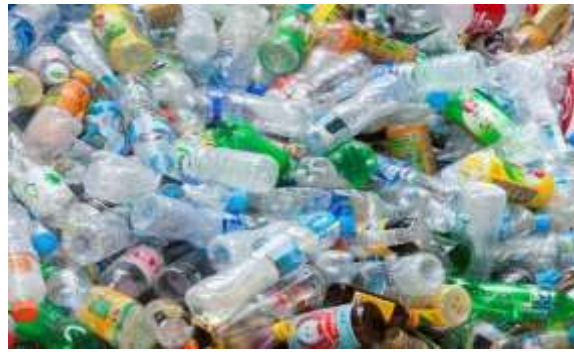
Fig.1: Collection of waste plastic bottles