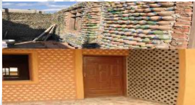
Fig.2: Construction of house using waste plastic bottle