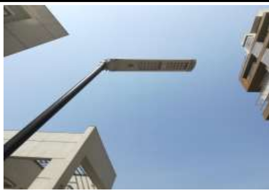
Automatic Solar street light