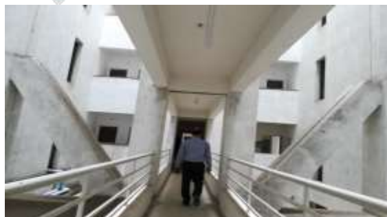
Interior Building Site (K Square)