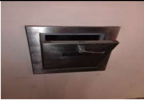
Zero Garbage system