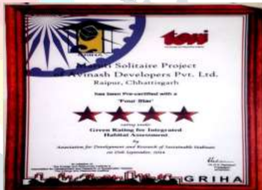
GRIHA Pre-certification to Maruti Solitaire (Base Case)