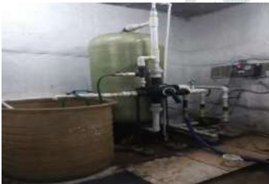
Centralized water purification system