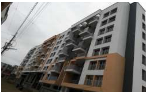
View of K Square building