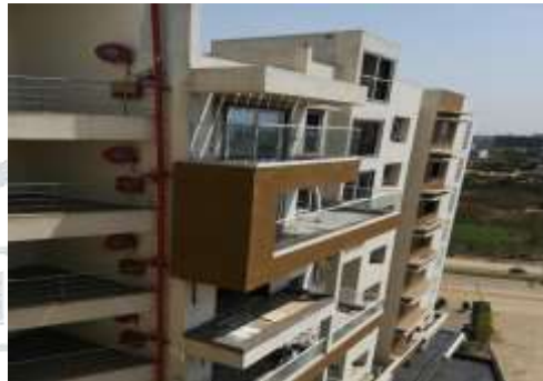
Fire-fighting Safety & beautiful fenestration