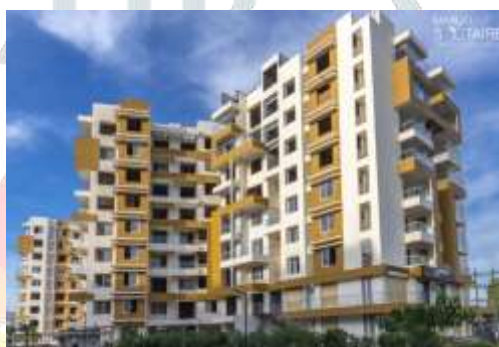
Ant Eye View of the building