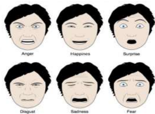
Figure 1. Types of Facial Expression

validation of human faces from images, videos & other forms of graphics. It traces face features, contours & structure to analyze individuals' unique biometric & demographic details. A face is always human's most sensitive & communicative part. Anger, disgust, fear, happiness, neutral, sad & surprise is all facial expressions. A smile on the human face displays its happiness & expresses the eye in a curved form [2].