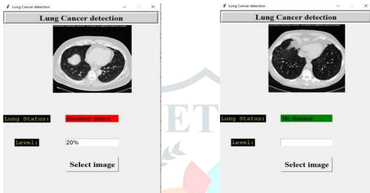
Fig. 1 Shows the output of lung cancer disease detection for images that have been affected by lung cancer with 20% affected

Figures show the results of lung cancer detection from lung CT image, in Fig.1 shows the output of lung cancer disease detection for images that have been affected by 20% lung cancer and Fig.2 shows the output as No disease, indicating that the input image unaffected by lung cancer.