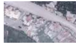
Khulna AEZ 12-13