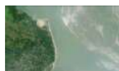
Sirajganj AEZ 7