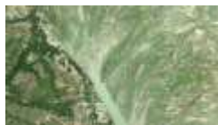
Faridpur AEZ 12