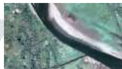
Goforgaon AEZ 9