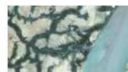
Saraon khola AEZ 13