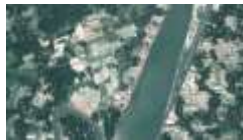
Madaripur AEZ 12-13