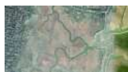
Rampal AEZ 13