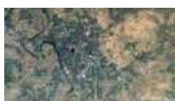
Bhaluka AEZ 9-28