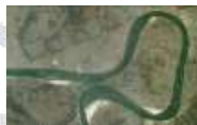
Farid AEZ 11-12