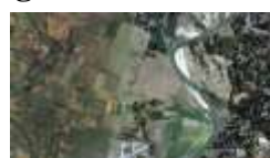
Thakurgaon AEZ 1-2