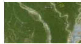
Rangpur AEZ 2-3