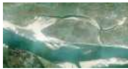
Rajbari Pabna 10-12