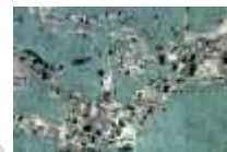
Gopal AEZ 12-13