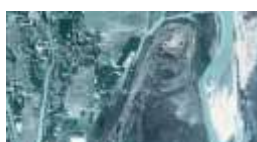
Shariatpur AEZ 12