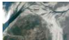
Chouhali AEZ 7-8