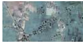
Gopal AEZ 13-14