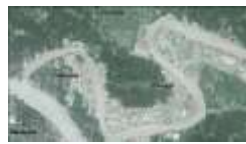
Khulna AEZ 13