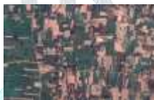
Barind AEZ 25-26 din