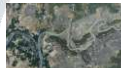
Atpara AEZ 8-9