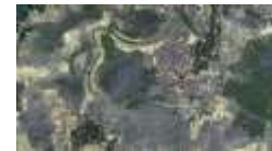
Atpara 2 AEZ 9