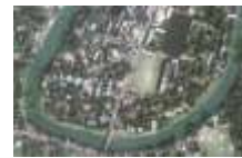
Net AEZ 8-9