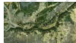
Atpara daoga AEZ 8-9