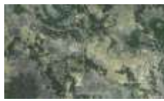
Mohanganj AEZ 8-9