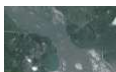
Rang AEZ 2-3