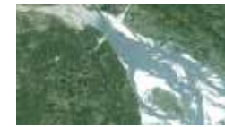
Kaunia AEZ 2-3