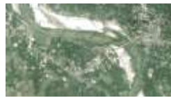
Panchagar AEZ 1-2