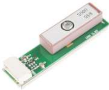
fig-3.2 –GP-735 sensor

The GP-735 is a small, thin, high performance, easy to use GPS smart antenna receiver. With only 29 second cold start time and, -162dBm tracking sensitivity, the GP735 is a very small, yet powerful piece. The thin and sleek design makes it perfect for many applications where the workspace will be less. This GPS module, based on the uBlox 7th generation chipset, has 56-channels, has an operating voltage of 3.3~5.5V, an antenna onboard, and connects to the system via TTL serial. The 1Hz update rate is quick enough for the majority of applications (and can be increased to 10Hz if you need). [7]