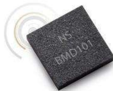
fig-3.4 –BMD101 Chip