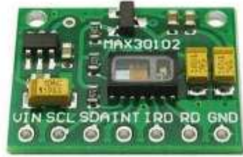
fig-3.1 –MAX30102 sensor

are passed. Based on the ratio of absorption of both the rays, the oxygen level is measured. It can calculate heart rate by analyzing the time series response of the reflected red and infrared light. [18]