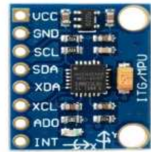
fig-3.3 –MPU6050 sensor

MPU6050 sensor which is compactable with Arduino microcontroller has MEMS accelerometer, MEMS gyro and temperature sensor. It is 6-axis motion tracking device. It combines 3-axis accelerometer, 3-axis gyro in a small package. It is an analog sensor but it is very accurate while converting from analog to digital because of its 16-bit analog to digital hardware. It measures x, y, z co-ordinates at the same time. It can also measure temperature in centigrade scale. I2C interface is present on the chip to communicate with Arduino or other microcontrollers. [6]