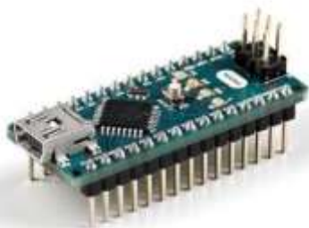
fig-1 – Arduino UNO

Arduino Nano is a microcontroller board; it is one of the smallest boards designed by Aduino.cc. Arduino Nano uses Atmega328 microcontroller, which is similar to the one used in Arduino UNO. It has different applications because of its small size and flexibility. Size matters a lot in Embedded as well. Embedded devices are preferred to be smaller in size. Arduino Nano is in-built with a crystal oscillator of frequency 16 MHz It is used for producing a clock of precise frequency using constant voltage. The one limitation present in Arduino Nano, i.e., it doesn't come with D.C. power jack means you cannot give external power source through a battery. [5]