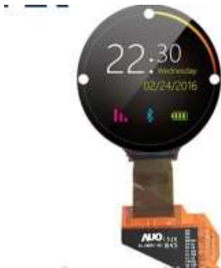
fig-4 –AMOLED screen

touch displays have a layer that recognizes touch on the top of the screen, but these AMOLED displays have the layer that is integrated into the screen itself. AMOLED displays has good contrast ratio, and it is clearly visible in the sunlight. This AMOLED display in our smartwatch displays various data obtained from Arduino Nano. AMOLED screen consumes more battery than normal LCD screen because of its high contrast ratio.