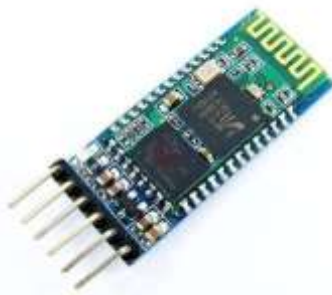
fig-5 –HC-05 Bluetooth module

One of the best technologies used for wireless communication is Bluetooth. HC-05 is the Bluetooth module compactable with Arduino Nano. This module uses serial communication to communicate with devices. It has USART serial port which is used to communicate with Arduino Nano microcontroller. The module works on 3.3 volts, and we can also connect it in 5 volts supply since it has the voltage regulator that converts 5 volts to 3.3 volts. This module can be used in master or slave configuration. Bluetooth module is used for sending the data from Arduino Nano to mobile application.