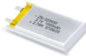
fig-6 –LiPo Battery

have bad temperature range from (0°C – 60°C) and discharging LiPo batteries to ultra-low voltages can be dangerous.