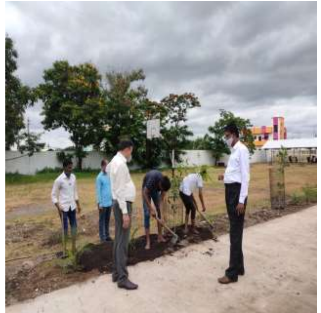
Fig. 4. Teachers with Earn and Learn Students