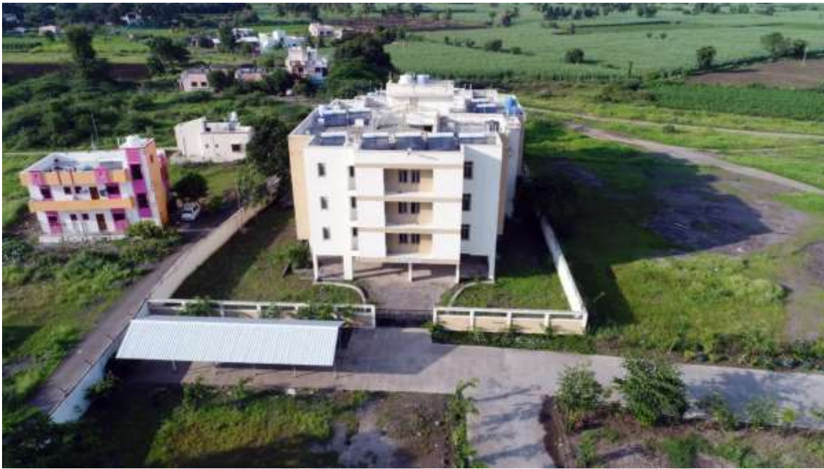
Fig. 6. Green and Clean Ladies Hostel Building