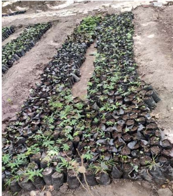
Fig. 8. Nursery Saplings made by Nursery Development and Management Students