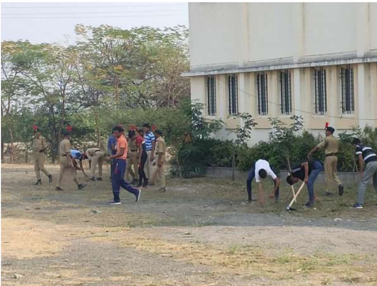
Fig. 7. NCC students cleaning the college campus