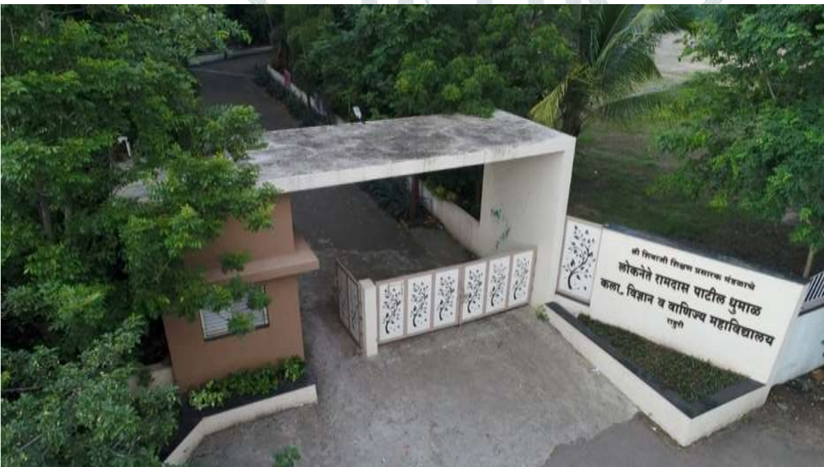
Fig. 2. Beautifying Entrance of College

In this research paper, we have included our activities on campus beautification through the students and different social groups.