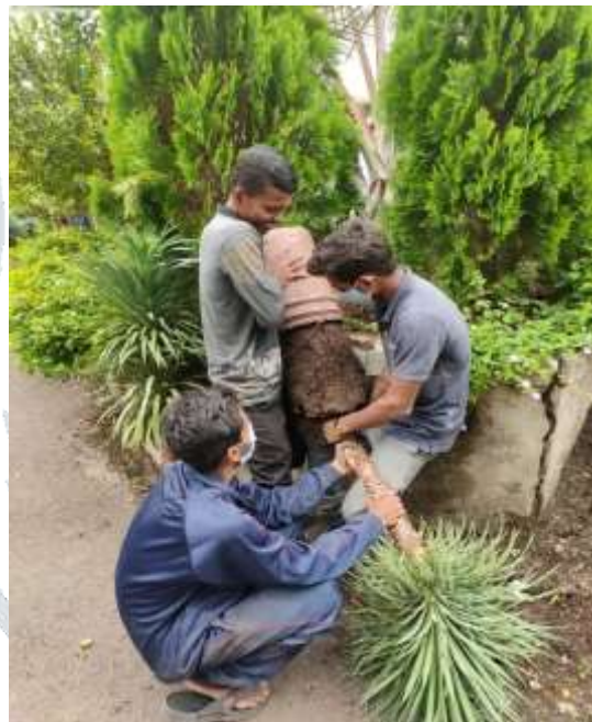
Fig. 5. Earn and Learn Students Transferring Yucca Plant