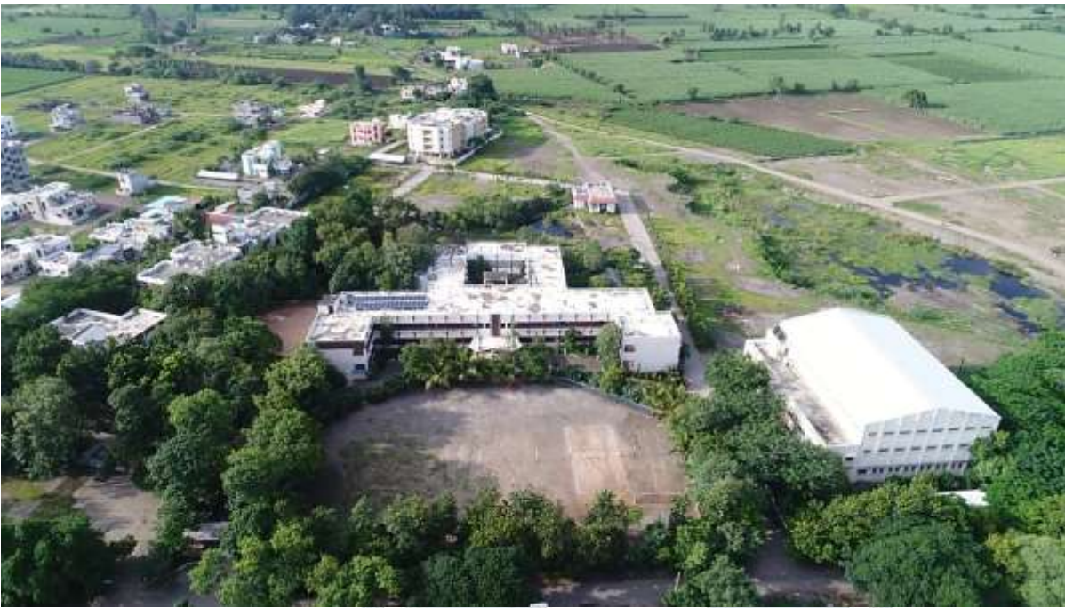
Fig. 1. College Campus Aerial View