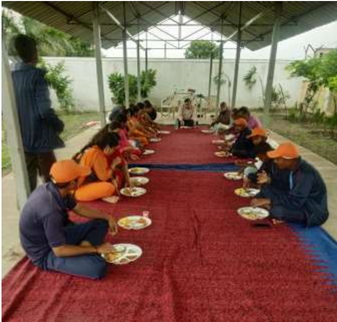
Fig. 3. Thursday Refreshment Program