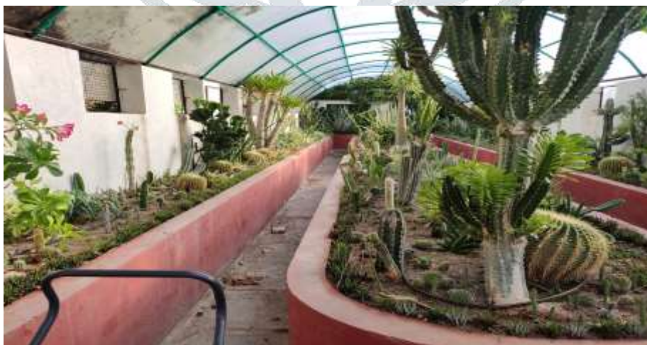
Fig. 9. Inside View of Cactus Garden

Campus vegetation includes representatives from each plant groups like Algae, Funga, Bryophytes, Pteridophytes, Gymnosperms, and Angiosperms due to flora includes xerophytes different habit having plants belonging to groups like herbs, shrubs, climbers, twiners, and trees are growing luxuriantly in hard strata substratum having campus. Ecologically different plant groups are growing xerophytes, and succulents are well flourished in the cactus garden. Hydrophytes are growing healthy in different ponds. Terrestrial plants give a marvelous look to the campus throughout the year. The pollution-free oxygen rich campus is attracting the visitors for jogging and yoga activities.