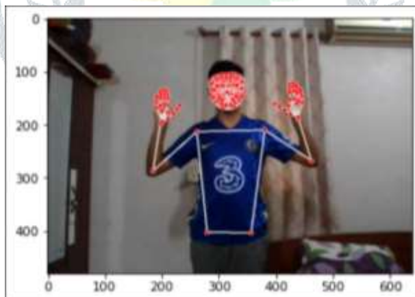
Fig 1: feature extraction

This solution is available for working with both a live video stream from a webcam and photo and video files. In the case of Python, MediaPipe is available as a Python module package. Mediapipe Holistic, determines key landmarks and stores them in a numpy array. So, at the end of the feature extraction process, we have a .npy file for each frame and a set of .npy files for each video.