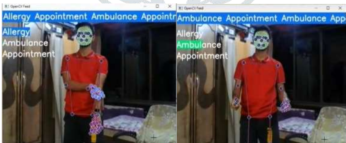
Fig 3: Model successfully recognizing “Allergy”