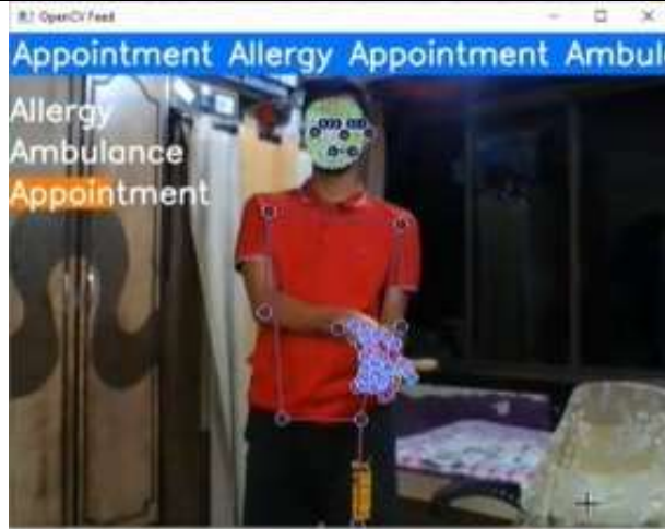
Fig 5: Model successfully recognizing “Appointment”