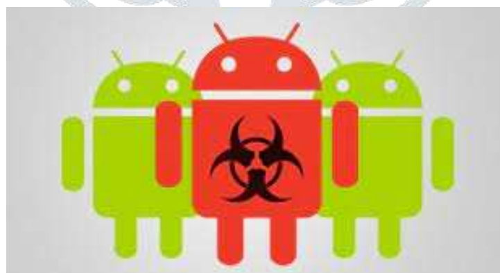
Figure 1: Android Malware

Mobile malware is malicious software that targets wireless-enabled device, by causing the collapse of the system and loss or leakage of confidential information. As wireless phones and PDA networks have become more and more common and have grown in complexity, it has become increasingly difficult to ensure their safety and security against electronic attacks in the form of viruses or other malware. Many types of malware exist, including computer viruses, worms, Trojan horses, ransomware, spyware, adware, rogue software, wiper, and scareware. The defense strategies against malware differs according to the type of malware but most can be thwarted by installing antivirus software, firewalls, applying regular patches to reduce zero-day attacks, securing networks from intrusion, having regular backups and isolating infected systems. Malware is now being designed to evade antivirus software detection algorithms.