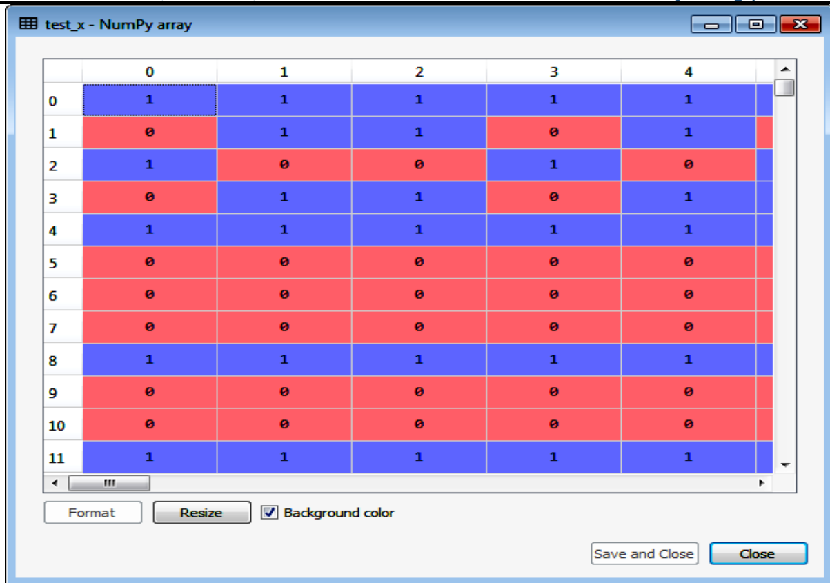
Figure 5: Test Data

Figure 5 is showing the x test of the given dataset. The given dataset is divided into the 20-30% part into the train dataset.