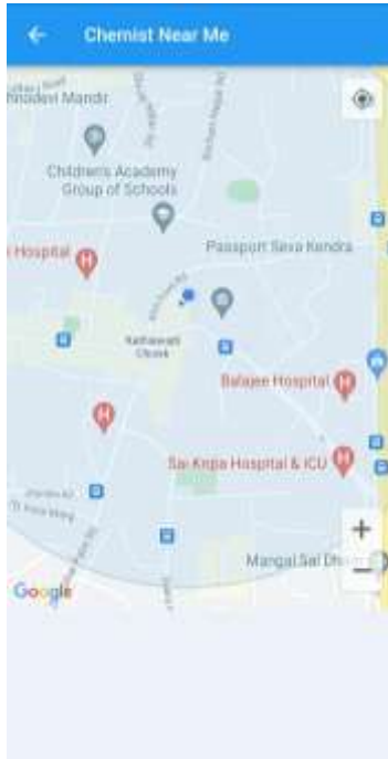
Figure 4 - Nearby chemist and hospitals

This improves the bot's accuracy in capturing and storing the user data for the record and can help track the diseases related to the age factor. This feature also allows the medical practitioner to view the patient's basic information without interaction with them in any emergency.