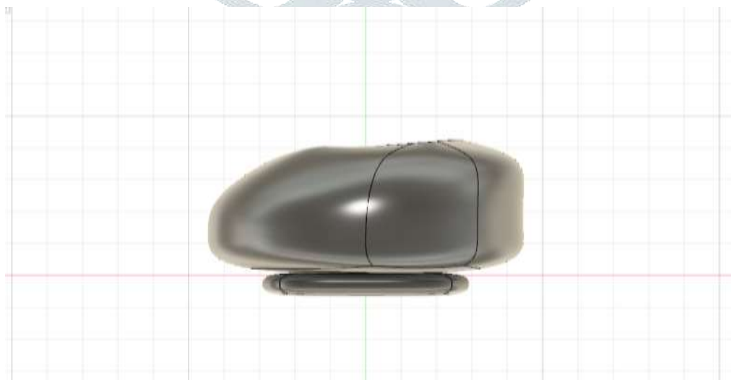
FIG.2 SIDE VIEW OF THE SPACE HABITATION MODULE