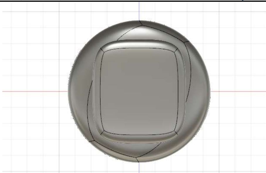
Fig. 3 bottom view of the space habitation module