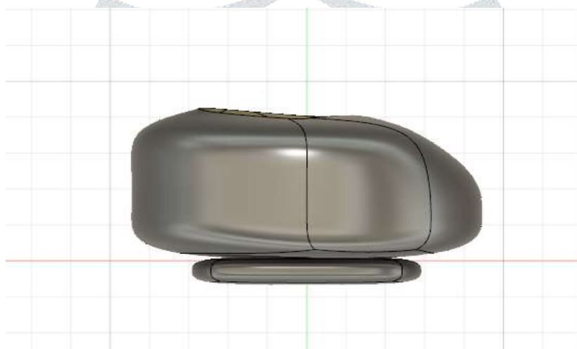
Fig. 4 backside of the space habitation module