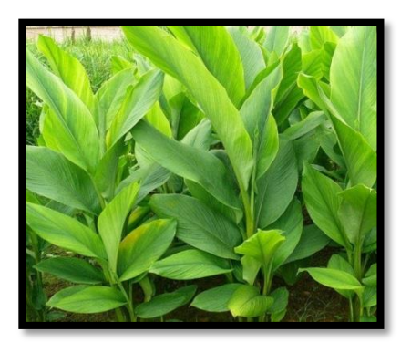
Fig. 2 Plant of Turmeric