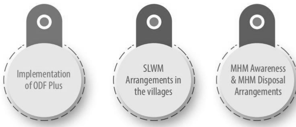
Figure 1: Main focus areas of SBM (G) 2022

"Sanitation takes precedence over political freedom." Gandhi, Mahatma. The Swachh Bharat Campaign was started on October 2, 2014, with the objective of achieving Swachh Bharat until October 2, 2019, the 150th birth ceremony of Mahatma Gandhi. Swachh Bharat Mission (Gramin) ("SBM(G)") is handled by the Department of Drinking Water & Sanitation, and Swachh Bharat Mission (Urban) is managed by the Ministry of Housing & Urban Affairs (MoHUA). Figure 1 depicts the primary strategic priorities of SBM (G) 2022.