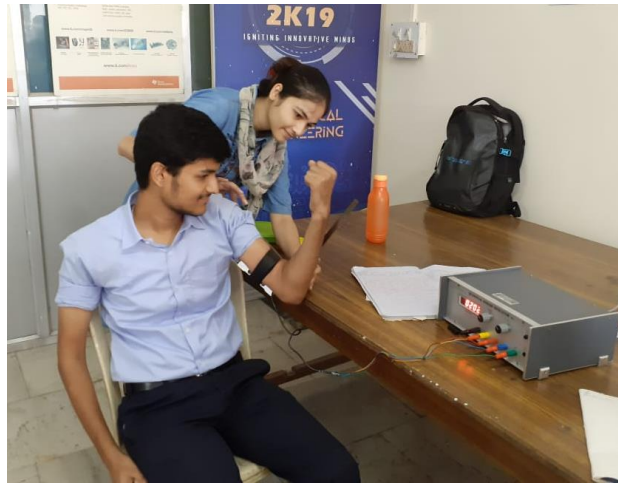
Figure-2: Experimental Setup and Measurement Procedure