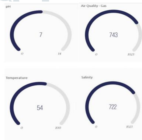
Fig 3. The values displayed on the Blynk application represent impure milk.