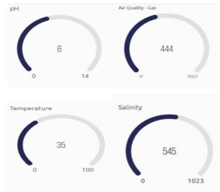
Fig 2. The values displayed on the Blynk application represent pure milk.