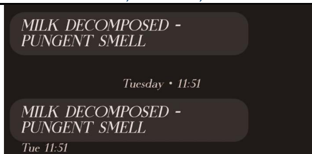
Fig 5. Message is sent to the predefined phone number when gas crosses the threshold value.