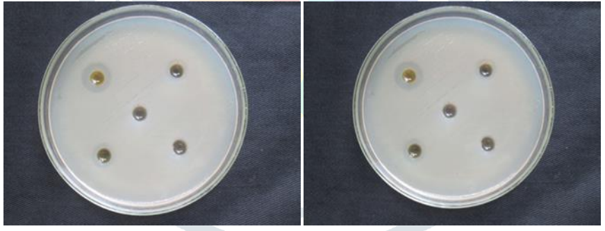
Figure.5 Catharanthus roseus- Antibacterial Activity

The antibacterial properties of Catharanthus roseus Linn ethanolic extract were investigated against the pathogenic microorganisms Staphylococcus aureus and Pseudomonas aeruginosa. The antibacterial activity of ethanolic extracts was measured in terms of bacterial growth inhibition zone. The antibacterial outcome has sparked interest in developing new antimicrobial medications that are free of adverse effects for the treatment of infectious disorders. The consequences of such colonisation in vital human organs as the lungs, urinary tract, and kidneys might be lethal. This bacterium is found on and in medical equipment, especially catheters, because it thrives on damp surfaces, causing cross-infections in hospitals and clinics. It can also degrade hydrocarbons and has been used to oil spills produce tar balls and oil. By disc diffusion technique, Catharanthus roseus leaf extract has high activity against Staphylococcus aureus with a zone of inhibition of 17 mm and Pseudomonas aeruginosa with a zone of inhibition of 18 mm..