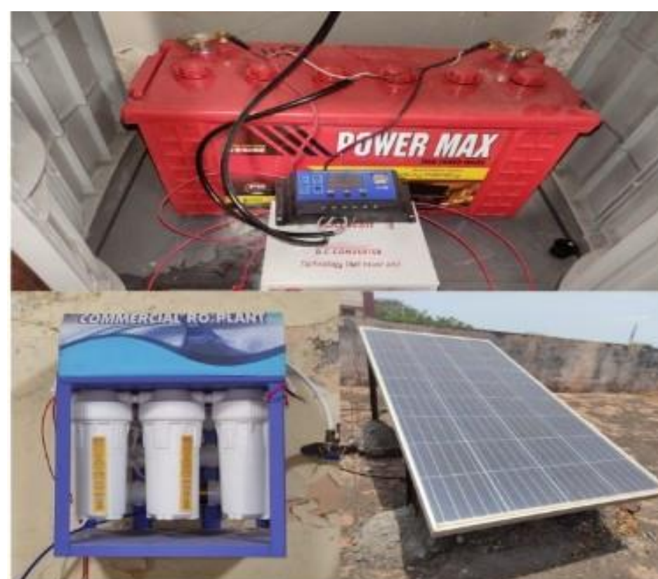
Fig(b): Output Module

The SOLAR RO system is made up of two parts: a power generation unit and a desalination unit. Because the RO unit requires a stable power supply, the system's electricity will be supplied by the solar PV array, and batteries will be linked to provide that power. The PV-generated energy is stored in a battery bank. The loads are powered by the stored energy. On the brine side, the RO desalination process comprises of a high-pressure pump, membrane unit, and pressure control valve. The solution is forced against the membrane by a pump, and water molecules pass through the membrane, reducing the concentration of the solute known as permeate, while the remaining water, which contains high salt concentrations, is rejected as a waste known as brine. The brine side valve is used to manage the amount of brine discharged as well as the system pressure.