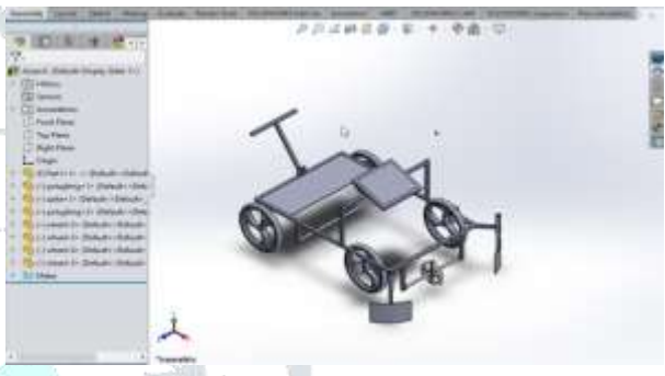
3D model of the machine