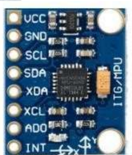
MPU-6050 3 Axis Accelerometer and Gyroscope sensor

MPU-6050: MPU6050 is based on Micro-Mechanical Systems (MEMS) technology. This sensor has a 3-axis accelerometer, a 3-axis gyroscope, and an inbuilt temperature sensor. It can be used to measure parameters like Acceleration, Velocity, Orientation, Displacement, etc.